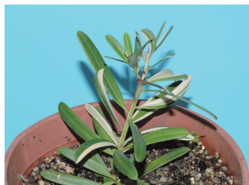
Fig. 4. Podocarpus costalis 'White Fasciate' (玉帶蘭嶼羅漢松).