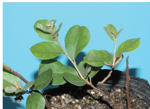
Fig. 2. Elaeagnus oldhamii 'Round' (圓葉植梧).