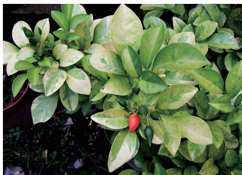
Fig. 3. Murraya paniculata 'Variegated Leaves' (花葉長果月橘).

Note: This cultivar was selected from the Beatitudes Garden (八福園) owned by the 2nd and 3rd authors. The main difference from M. paniculata (Chang and Hartley 1993) is the white patches on the leaf surface. The cultivar name 'Variegated Leaves' is derived from this character.