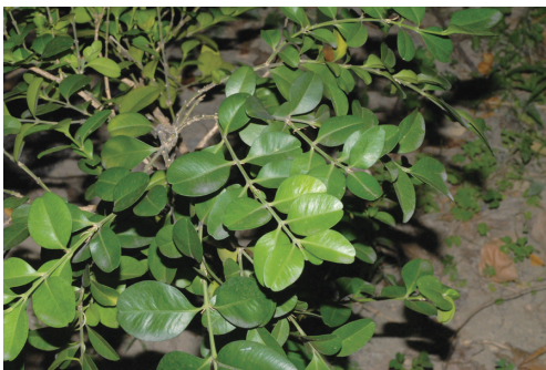
Fig. 1. Buxus liukuensis 'Round' (圓葉琉球黃楊).

Small evergreen tree. Leaves chartaceous, widely obovate, 1.25~5.0 cm long, 2.0~3.2 cm wide, rounded and emarginated at apex, acute at base. Scales mostly silvery. Standard: S. Y. Lu 29502 (TAIF), specimen prepared from a plant cultivated at Taipei Bo-