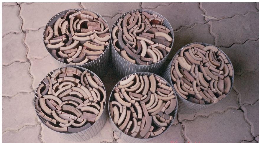
Fig. 2. Three kinds of bamboo specimens in stainless steel cylinders for charcoal making.

a specimen. The electrical resistivity, \rho , was calculated as: