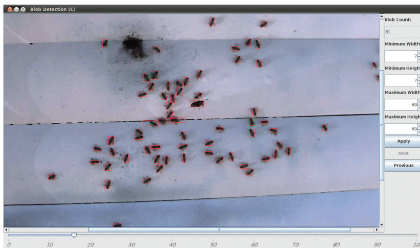
Fig. 1. A graphical user interface showing the image with a colored square around the recognized blob and the automatic process of counting the number of bees.

Users can perform bee counting using either Calibrate or AutoDetect. Calibrate is a GUI (Graphical User Interface) containing controls and the processed picture, with the boxed bees used to run the job of counting (Fig. 1). Since the Calibrate program is relatively slow, it is not recommended for processing many pictures at the same time. The interface provides users with the ability to adjust the box sizes of bees they want to count, and control the brightness for recognizing the bees. Alternatively, users can choose another program called AutoDetect which is a non-GUI program. This program is very fast and displays results on the command line. AutoDetect can also compute the average count, time elapsed, and speed of the process when processing many pictures at the same time (Fig. 2). When processing many pictures at the same time, it is better to use the AutoDe-